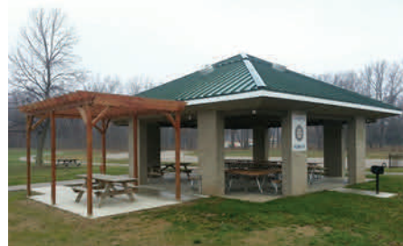
Picnic shelter at Flesher Field

Originally a fire station, the Oshtemo Community Center , 6407 Parkview, features two rooms that can be rented separately or together. Each room includes a small refrigerator, sink, microwave, tables, and chairs. A shared foyer and restrooms are located between the two rooms. Rental fee is $50 for a half day or $75 for a full day from Monday through Thursday and $75 for a half day and $100 for a full day from Friday through Sunday. Security deposit and proof of insurance liability are required. If alcohol will be served, a Host Liquor Liability Insurance Policy and additional security deposit are required. Rental is available only to Oshtemo Township residents.