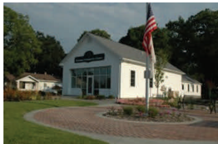
Oshtemo Community Center