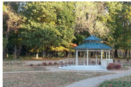
Gazebo at Flesher Field