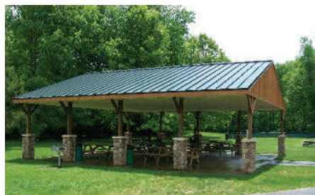
Picnic shelter at Oshtemo Township Park