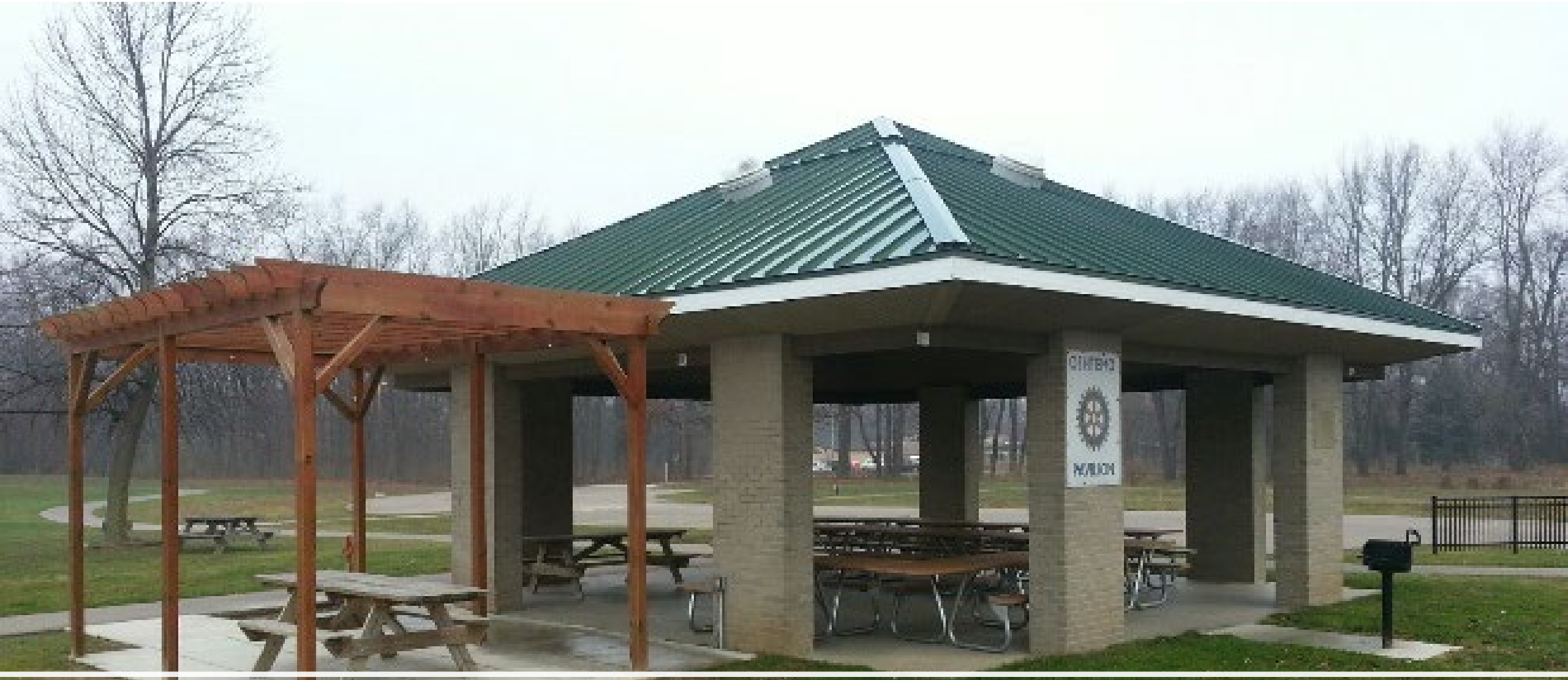
Flesher Field 3664 South 9 th Street