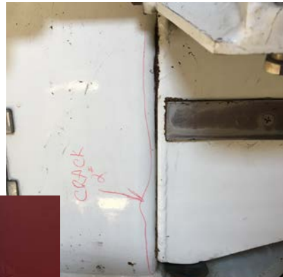
Cracked weld on turntable.

With these factors in mind, I am asking that we be allowed to accelerate the scheduled 2019 replacement of this apparatus by immediately beginning the process. Due to urgency, it is my intent to first develop the needs specification and then focus on finding an available demonstrator unit. That could result in this planned 2019 expenditure occurring yet this year.