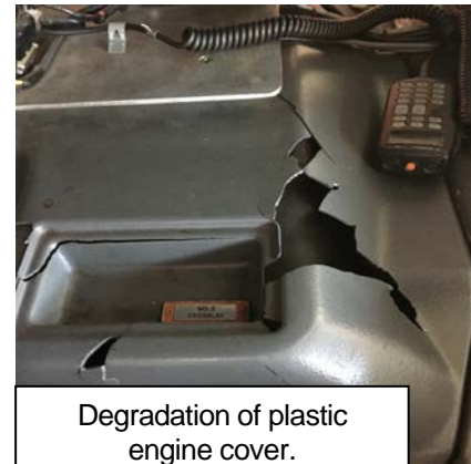
Degradation of plastic engine cover.