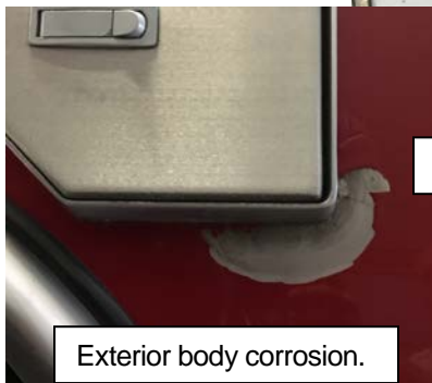
Exterior body corrosion.