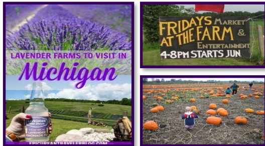
Examples of Agritourism

Agribusiness/Agritourism - During the public meetings of the 2017 Master Plan Update, residents in the rural areas indicated a desire to preserve property, but needed a revenue source to assist with this preservation. In addition, those that produced an agricultural product wanted other economic opportunities that would help to support their farming operations. In response to these requests, the Rural Character Preservation Strategy chapter of the Master Plan includes a strategy to update the Zoning Ordinance to allow for these types of businesses. In April of 2018 the Planning Commission started to work on a Agribusiness/Agritourism Ordinance to implement this strategy. After multiple reviews, the Planning Commission held a public hearing for the drafted amendment on March 28, 2019 where a motion to recommend approval to the Township Board was unanimously accepted. After discussion and additional modifications, the Township Board adopted the Agribusiness/Agritourism Ordinance amendment in May 2019.